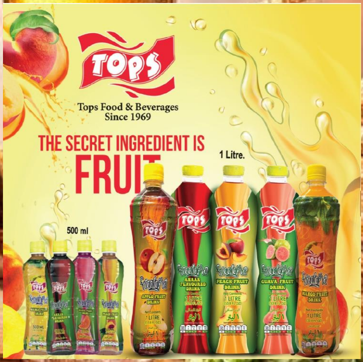
TOPS & MURREE SPARKLETTES